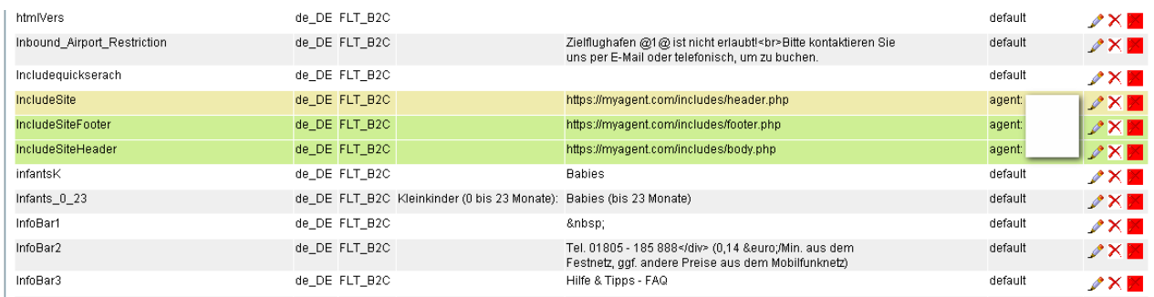
Img 3 – language tool